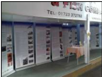
Photo above left - Our 'Scarborough in world war two' exhibition is on display in the empty fish shop area of the Market Hall.

VIOLA—The Life and Times of a Hull Steam Trawler is an engrossing read. Some 800 trawlers and their crews were engaged in the most dangerous civilian occupation in WW1. They were requisitioned from the Hull and Grimsby fleets to hunt U-boats and sweep for mines. One quarter of those vessels were lost, along with half their crew. Viola was one of this fleet and was built in Beverley. She survived the war and was sold into whaling, sealing, and exploration in the far South Atlantic. Today she lies rusting at the derelict whaling station of Grytviken in South Georgia. Available from Lodestar books (internet) £12.